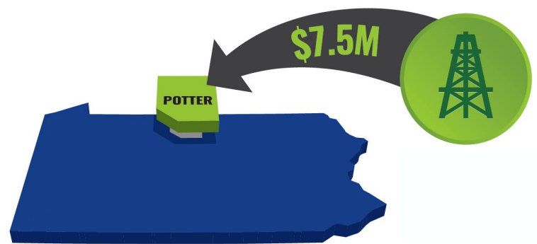
Potter County & Municipal Spending 2011-2016

POTTER COUNTY HAS RECEIVED NEARLY $7.5 MILLION IN NEW REVENUE SINCE 2011